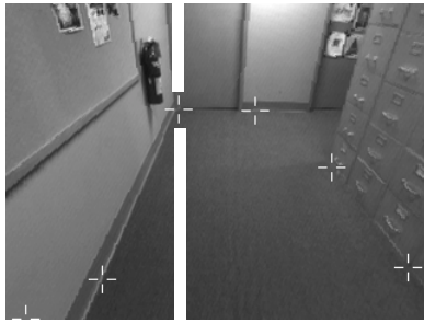
Figure 2: What the vision subsystem computed. For a given column of the image, the evolved vision subsystems computed the boundary between the ground (lower line) and a non-ground object (upper line). If there was more than one such boundary, the lowest was desired. This was done independently for six columns in the image.

For the person constructing the system, there is another asymmetry between the two subsystems: the vision subsystem is much harder to create. The output of the vision subsystem is the estimated distance to the first obstacle in various directions, and in this way similar to sonar. The navigation subsystem can therefore adapt designs created for sonar. When it comes to navigation, sonar is a much more common sensor than vision, so navigation from this type of data is well understood. In contrast, while there has been much work on computer vision, there has been little applying it to obstacle avoidance on a mobile robot.